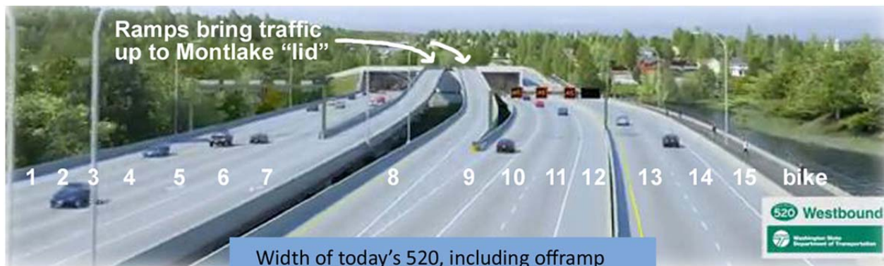
Approaching Montlake from the east. WSDOT video image. Our labels show the number of lane-widths.

The increased size and presence of the currently proposed 520 highway will blight much of our city: historic Roanoke Park, Portage Bay, Capitol Hill, Montlake, Madison Park, Laurelhurst, and University District. Property values will drop, thanks to huge concrete walls, increased noise, pollution and neighborhood traffic. Imagine the scene below when it fills with vehicles!